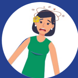
B alance Loss Nusunon Wenewenen