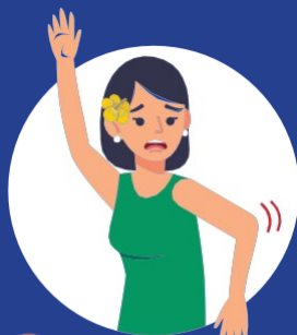
A rm Weakness Apwangepwang en Poun