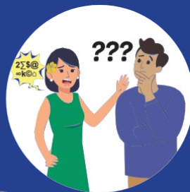
S peech Difficulty Weiresin an Kapas