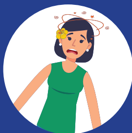
B alance Loss