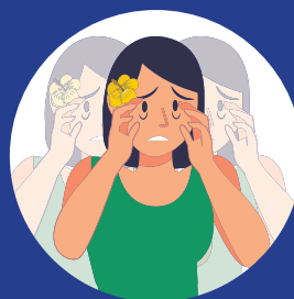
E yesight Problems