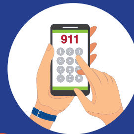
T ime to call 9-1-1