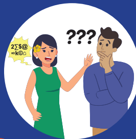
S peech Difficulty