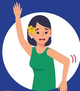
A rm Weakness